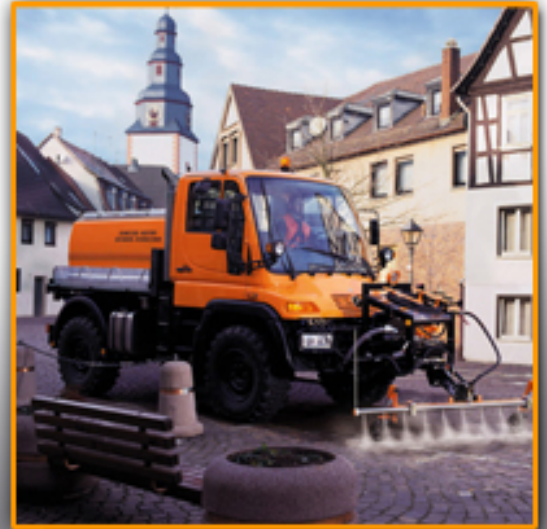
fig. UNIMOG municipal service vehicle

The most well-known multi-purpose vehicle on the market is the UNIMOG from Mercedes-Benz .