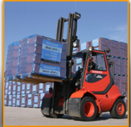
fig. fork lift